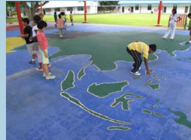
Dropping coins in the name of charity

Many thanks to all the students who participated, the staff who helped protect the coins during break, the local Baiduri bank