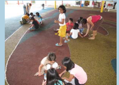
Covering the play area

staff for counting the coins and of course to the PTP for organising the event.